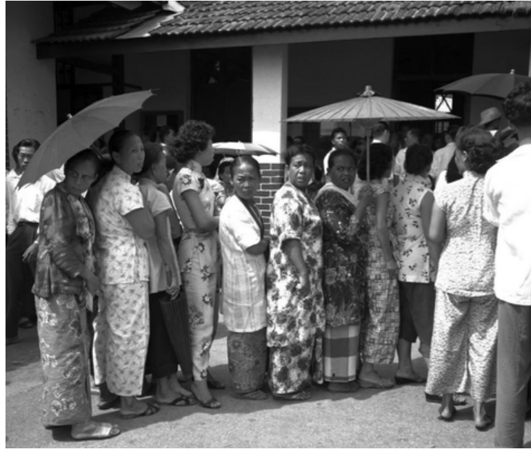
In the 1959 Legislative Assembly election, the People's Action Party campaigned openly on the "one man, one wife" slogan, at a time when women voters turned out in large numbers following the introduction of compulsory voting.

The Women's Charter provides the legal boundaries for marriage and family life. Within these boundaries, the wife as solicitor-general of the home maintains a posture of righteousness—spirit, mind, and body aligned—throughout the length of her days. This is not performance or pretense, but the steady cultivation of godly character in service of building a marriage and home founded on biblical principles.